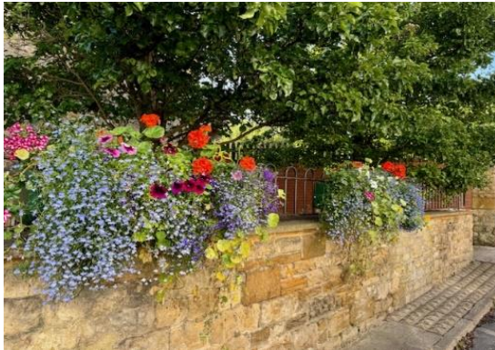
Our floral displays at the top of Church Street welcome people into town.

This will be held in the afternoon on Wednesday 20 th November, 2.30pm. at Oscar's. Everyone is welcome.