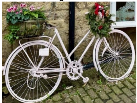
The Lacquer Lounge's Bike