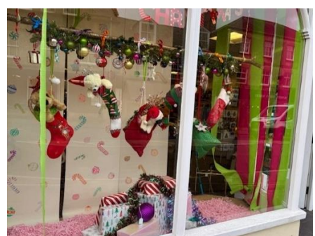
St Margaret's Hospice