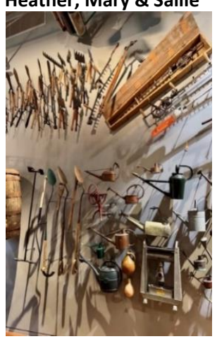
So many tools

Mary arranged a wonderful fact-finding trip to The Newt, a working estate with productive gardens and farmland, between Bruton and Castle Cary. A rare sunny day, it was perfect for our walk around the immaculately manicured grounds with centuries old Hadspen House at the heart. Highlights were the 300 varieties of apple trees, intricately trained to form curious shapes; the veritable mansion for bugs; implements galore at the Story of Gardening, the Roman Villa and the Beezantium which explores the connection between bees, the land, and humans. Roam the estate and you'll travel through two thousand years of horticultural history.